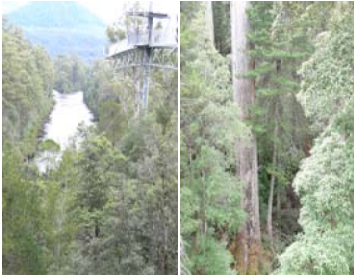
Tahune Air Walk/E obliqua