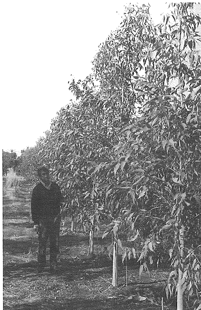
Don Jowett beside 30 month old Spotted Gums at Hensley Park.

These results provide no evidence to support the ripping of basalt soils with a farm tractor or D4 dozer as a way of improving tree growth. However, the depth of ripping achieved was only 35-45 cm at Buckley Swamp and 40-50 cm at Hensley Park. This was probably insufficient to penetrate the buck-shot clay layer. Ripping with a bulldozer to 65 cm on a site nearby resulted in a significant effect on growth of blue gums (see Agroforestry News Dec 1997 ).