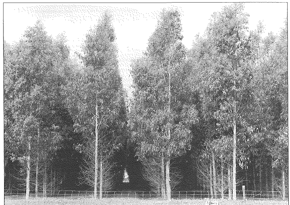
Figure 1: A 5-year-old plantation established at PVI in 1996. From left to right, the treatments are control, rip only, rip plus large mound and rip plus small mound.

various ripping tine configurations in a plantation cultivation trial in eastern Australia. New Forests 21, 231-248.